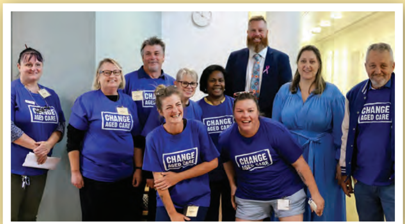
Meeting with Aged Care Workers from the Hunter with Assistant Health Minister Emma McBride.

Aged care workers look after our loved ones and it's time we look after them.