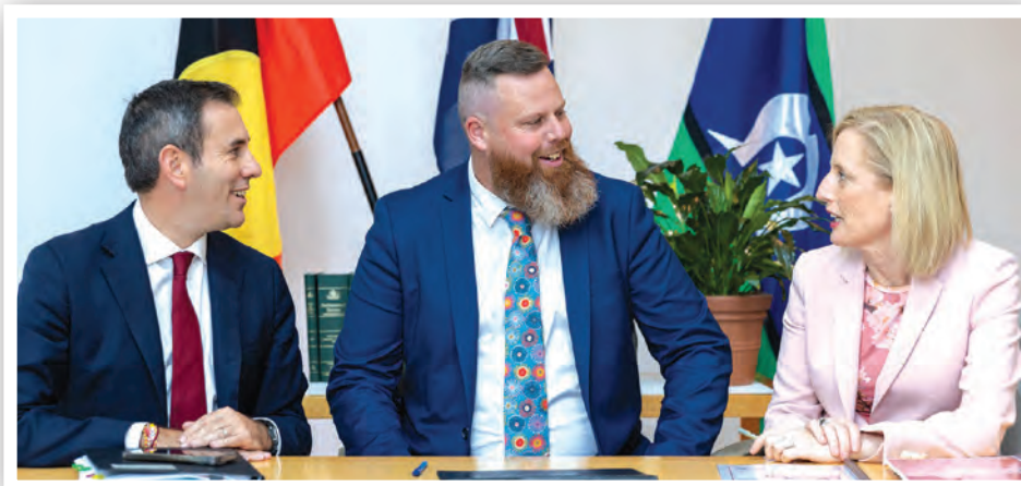
Chatting with our Treasurer Dr Jim Chalmers and our Finance Minister, Senator Katy Gallagher.

I am proud to be part of a Government that has handed down a responsible and practical Budget that will deliver targeted relief to the people who need it most. I'll keep working hard every day to deliver for the Hunter electorate.